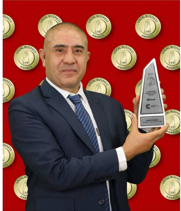
Our Principal named the Winner

Step into the amazing world of Vivid Sydney at the Royal Botanic Garden Sydney, The Rocks, Barangaroo and Darling Harbour, along with the city's King's Cross, Chatswood and Taronga Zoo.